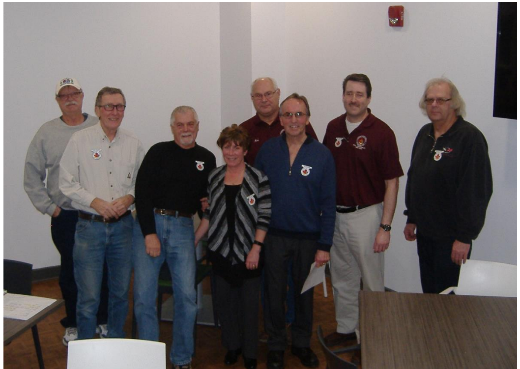
Some of the new executive who were at the January Club meeting

There was also talk about being invited to the R&M facility in Chatham, where we would tour the museum and the shop. Both of these are now closed to the public. It was suggested we could invite our American Corvette friends to attend also.