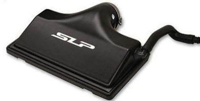
Air-Box Lid, 2000-02 V8 Camaro/Firebird

$80 Contact Jim 969-2013 or jsmith@mnsi.net